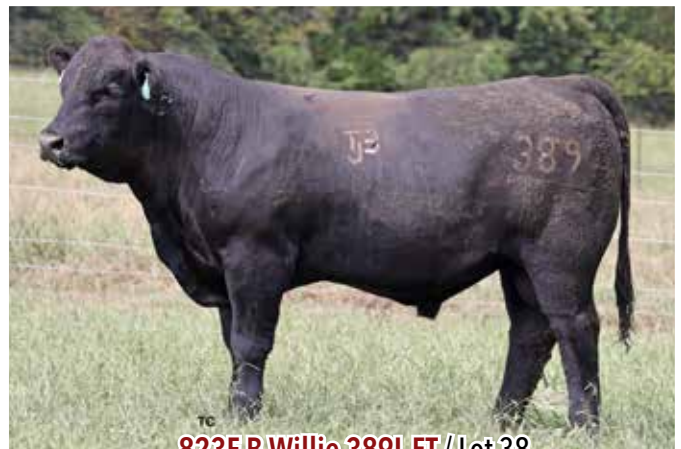
823F B Willie 389L ET / Lot 38