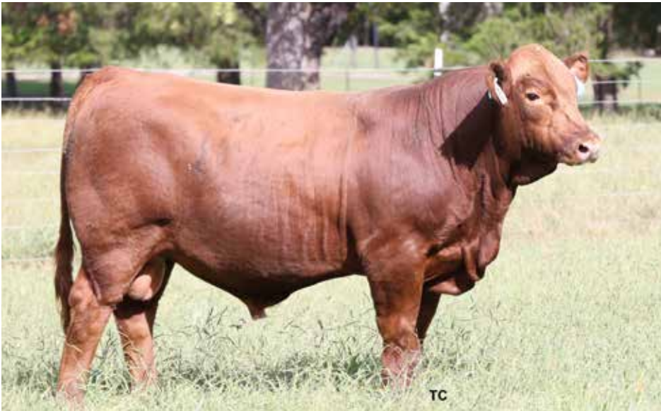
J251 Finnegan 385L / Lot 16

Lot 15 TJB D24 FINNEGAN 365L BULL AMGV1597651 Breed Comp: GV 100%