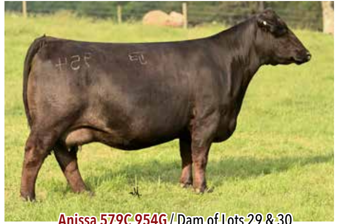
Anissa 579C 954G / Dam of Lots 29 & 30