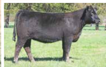
Anissa 579C 140J ET Dam of Lot 28

Lot 27 J321 REBEL YELL 3100L BULL AMGV1589050 Breed Comp: GV 65.7% AN 34.4%