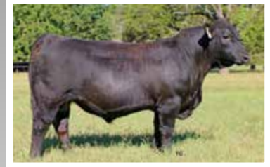
TJB ACUNA 214K