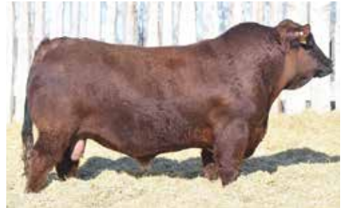
Hillsdwn Finnegan 4F Sire of Lots 15 & 16