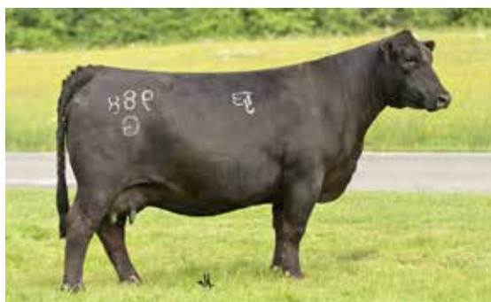
Anissa 149X 988G ET / Dam of Lot 19

Lot 19 988G B WILLIE 3132L BULL AMGV1589066 Breed Comp: GV 43.8% AN 56.3%