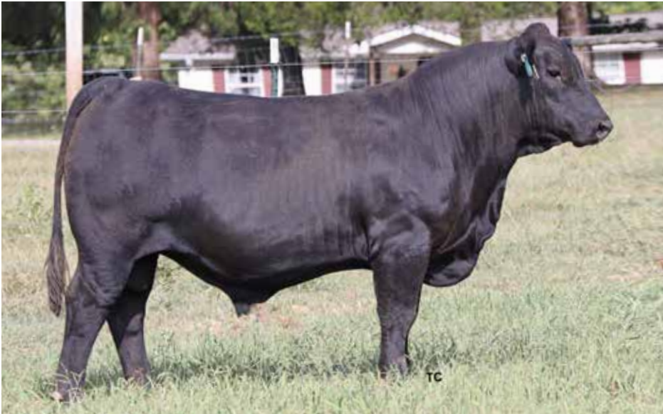
579C GRAND PLAN 394L / Lot 25