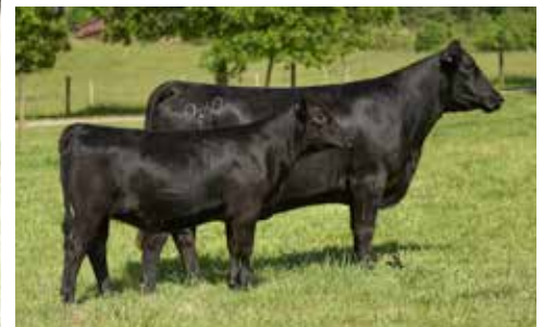
Vickie Vale B H040 ET

Lot 46 H040 B WILLIE 317L ET BULL AMGV1599631 Breed Comp: GV 52.3% AN 47.7%