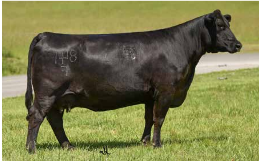
Blackbird 429B 814F / Dam of Lots 8, 9 & 10