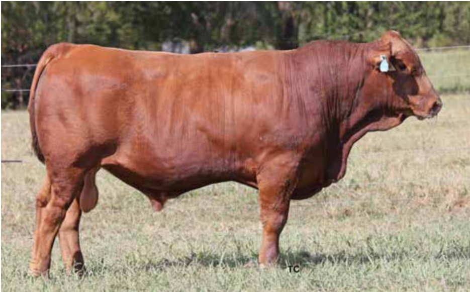
TJB D24 Finnegan 365L / Lot 15