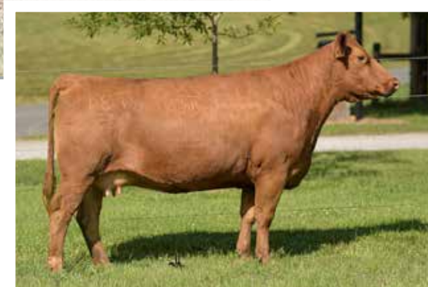
Anissa 149X 713 ET / Dam of Lot 20