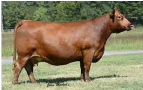
TJB Anissa 913U 149X Dam of Lots 17 & 18