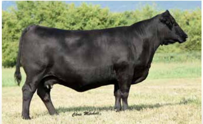
Lady Granite 321A ET / Dam of Lot 7

Lot 7 stems from a joint embryo venture on 321A with JGP Gelbvieh in MO. His dam is a beautiful uddered 11 year old cow. It is no secret we love our Rebel Yell sired calves.