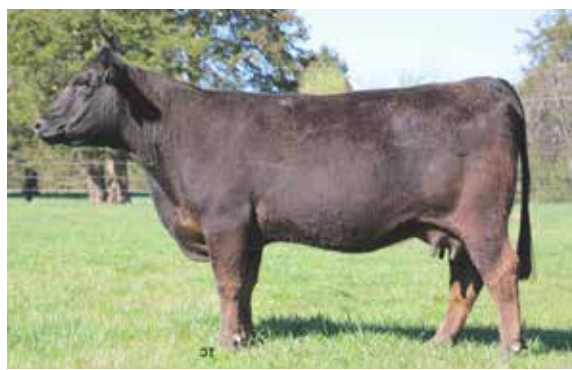
Blackcap 823T 926G ET / Dam of Lot 40