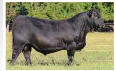
TAYD 579C COPPERFIELD 213K ET