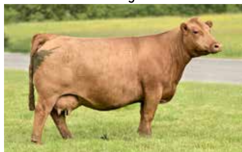
Lady Granite 873F / Donor dam of Lots 2-5

Lot 2 873F JUST N TIME 316L ET BULL AMGV1597486 Breed Comp: GV 56.1% AR 31.3% AN 12.5%