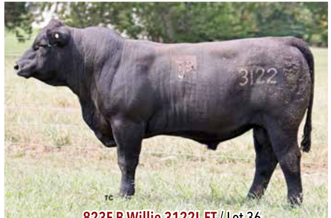
823F B Willie 3122L ET / Lot 36

Turn him out on heifers and sleep well during calving season! He marks an 18 CED ranking in the top 4% while also ranking 15% WW and 20% YW.