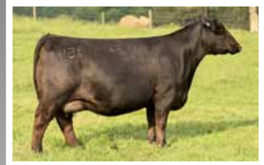
ANISSA 579C 954G