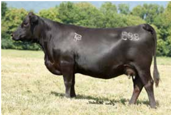
Anissa 359Z 588C / Dam of Lot 21