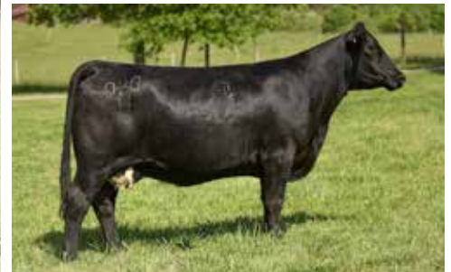
Vickie Vale B H040 ET Dam of Lot 46 & 47

The dam to lots 46 and 47 is one of our favorite young cows. Shes a beautiful 4 year old 914U x Sandtrap daughter that we are expecting big things from. Her first calf was a Rebel Yell heifer that is going to hit the donor pen after calving this fall.