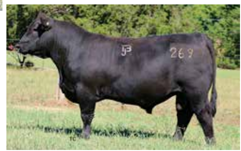
926G REBEL YELL 269K / Full sib to Lot 40