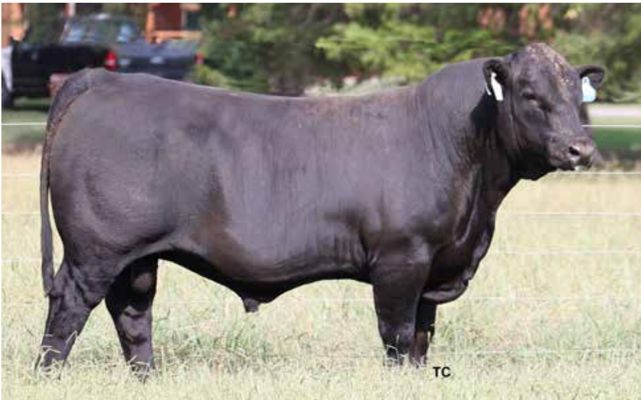
H040 B Willie 317L ET / Lot 46