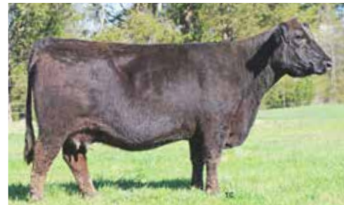
Anissa 921U 4102C ET / Dam of Lot 32