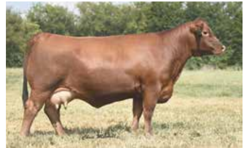
Blackbird 827T 410B ET Dam of Lot 13