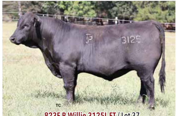
823F B Willie 3125L ET / Lot 37