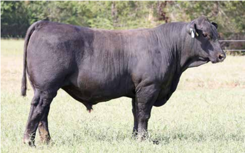
579C 417 JUSTICE 306L ET / Lot 26