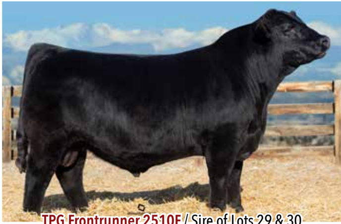
TPG Fronrunner 2510F / Sire of Lots 29 & 30