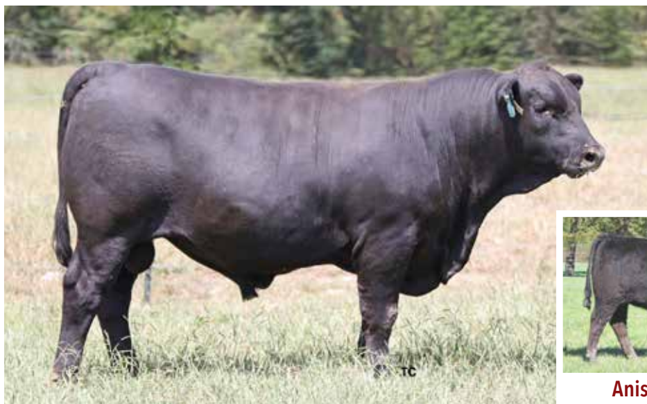
140J Fronrunner 377L / Lot 28