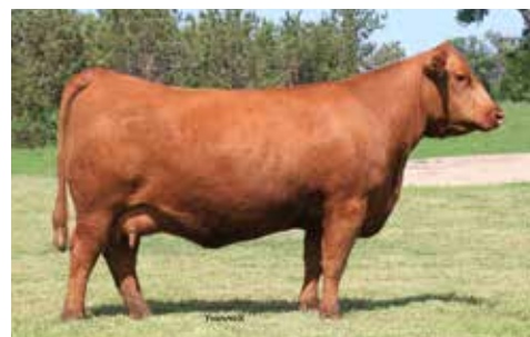
Lady Granite 258Y ET Maternal grandam of Lots 2-5