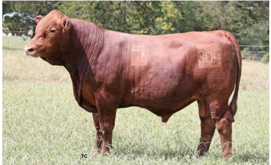
149X Just Do It 304L ET / Lot 18