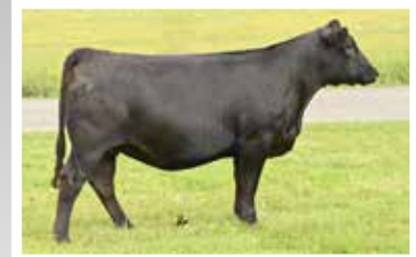
ANISSA 579C 243K ET