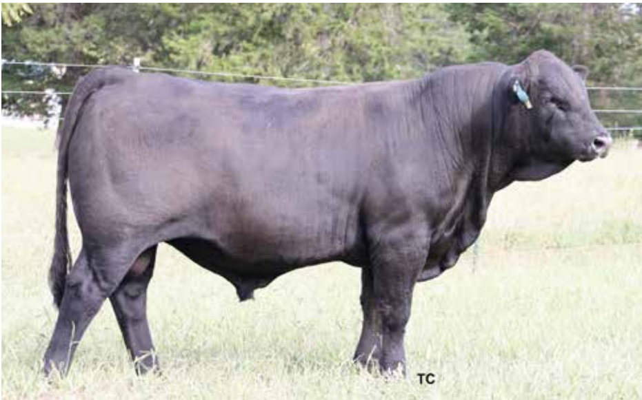
H040 B Willie 318L ET / Lot 47

The dam to lots 46 and 47 is one of our favorite young cows. Shes a beautiful 4 year old 914U x Sandtrap daughter that we are expecting big things from. Her first calf was a Rebel Yell heifer that is going to hit the donor pen after calving this fall.