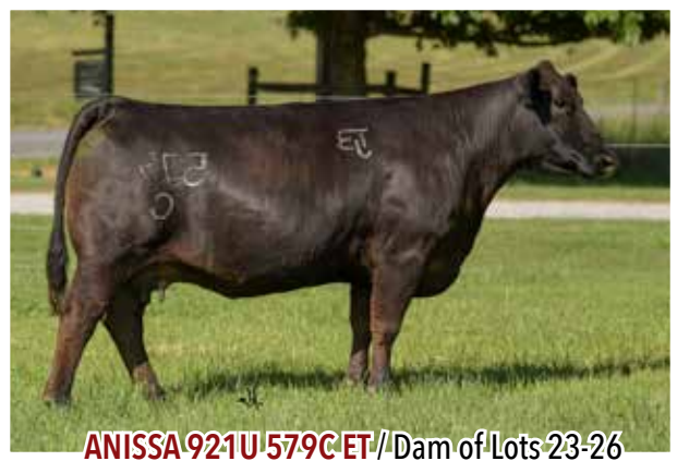
ANISSA 921U 579C ET // Dam of Lots 23-26

Some cows are just no miss and 579C is one of those cows. I could write a book on all of her contributions to our program. As of today she has 98 recorded progeny with a dozen more on the ground. She has amassed over $200,000 in progeny sales. Most notably being 954G who Warner Beef Genetics purchased 1/2 interest in for $20,000. Her full brother TJB Acuna 214K is also walking the pastures at Warner Beef was purchased for $9000 out of last year's sale. That flush of Copperfield bulls averaged just under $5,500. Lots 23 and 24 are sired by Probity, making them 3/4 brothers to the infamous Rebel Yell.