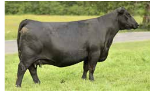
Velvet 137X 978G ET Dam of Lot 14