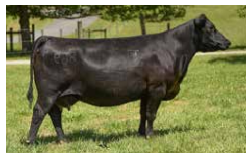
Anissa 869F ET / Dam of Lots 34 & 35