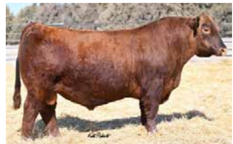
Just N Time 714J / Sire of Lot 33