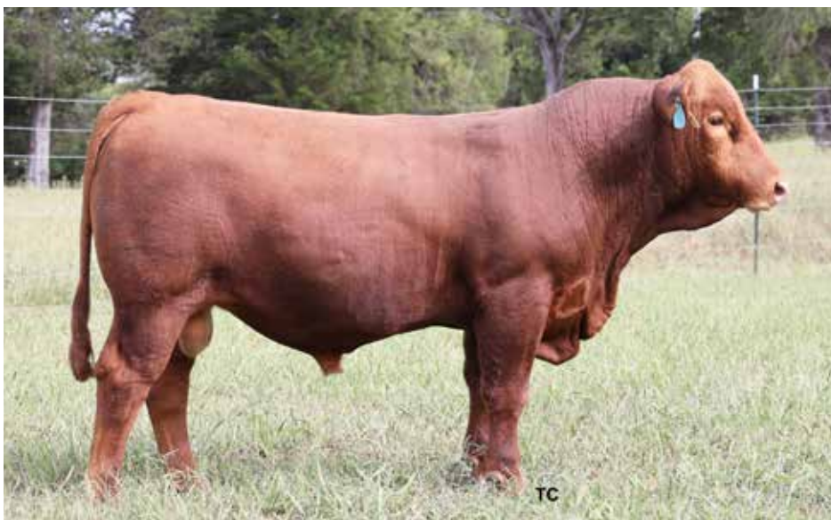
1127J Just N Time 375L / Lot 33