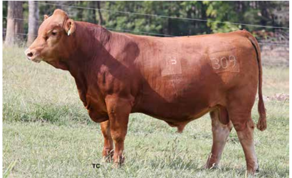
149X Just Do It 309L ET / Lot 17