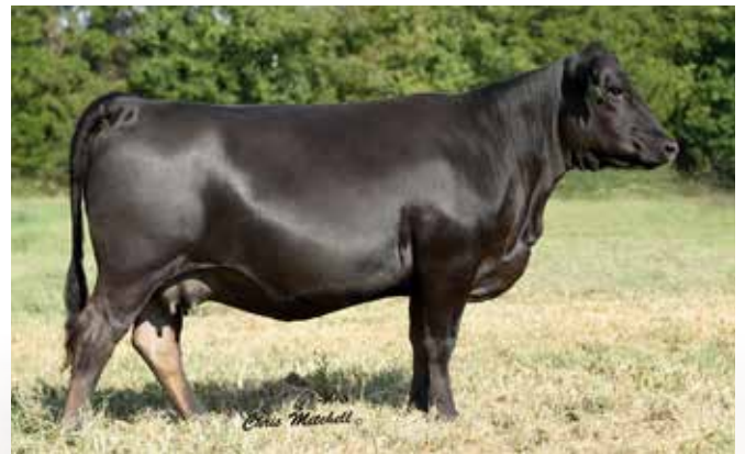
Blackcap 823T 567C ET / Dam of Lot 42

3120L comes from a moderate framed cow with a flawless udder. She always raises a nice calf and breeds back first AI every year.