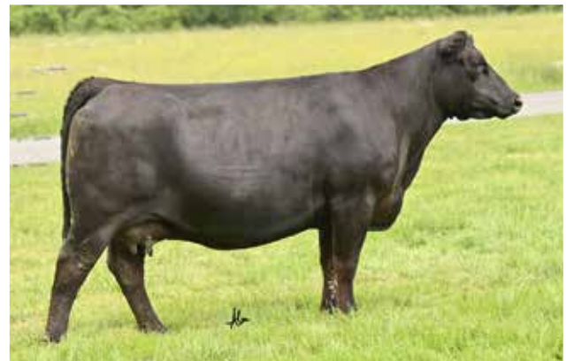
Anissa 986G ET / Dam of Lot 31

Willie treated us well in this calf crop. His dam is a direct daughter of the original Anissa, 337M. 382L comes with plenty muscle and has a well balanced set of EPD's. All but 2 of the 15 measured traits are on the right side of breed average. He combines calving ease with growth.