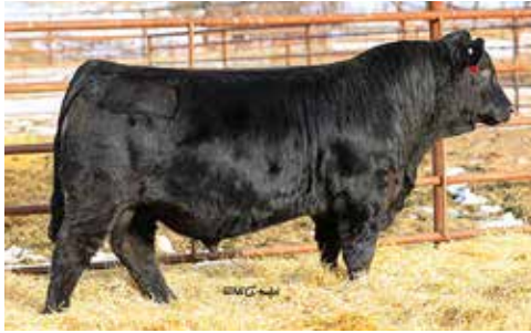
Just Do It J120 Sire of Lots 17 & 18