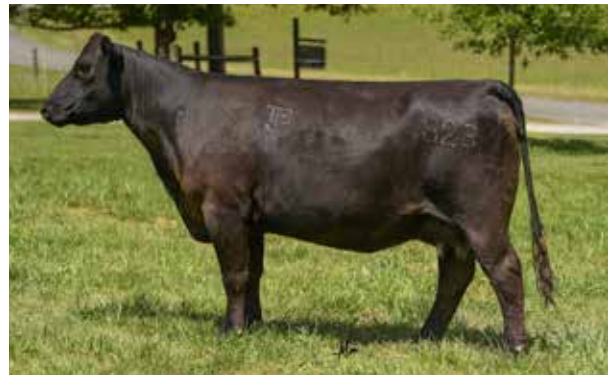
Anissa 921U 823F ET / Dam of Lots 36-38

Lot 36 823F B WILLIE 3122L ET BULL AMGV1589099 Breed Comp: GV 50% AN 50%