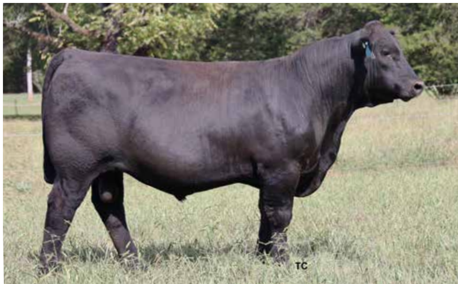
J321 Rebel Yell 3100L / Lot 27