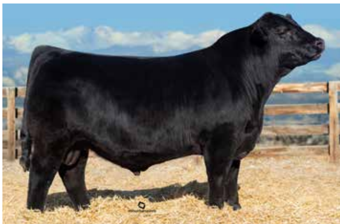
TPG Fronrunner 2510F / Sire of Lots 8, 9 & 10