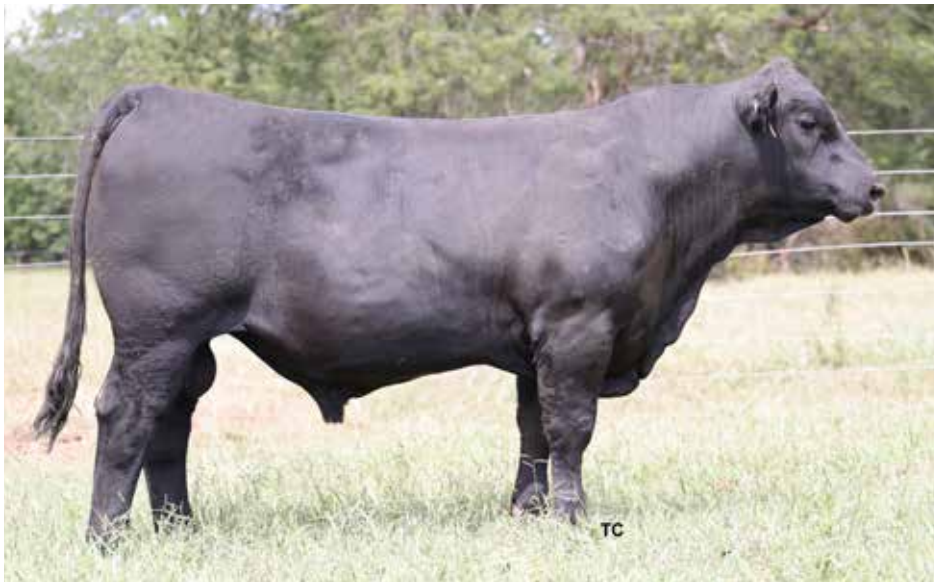
4102C Fronrunner 310L ET / Lot 32