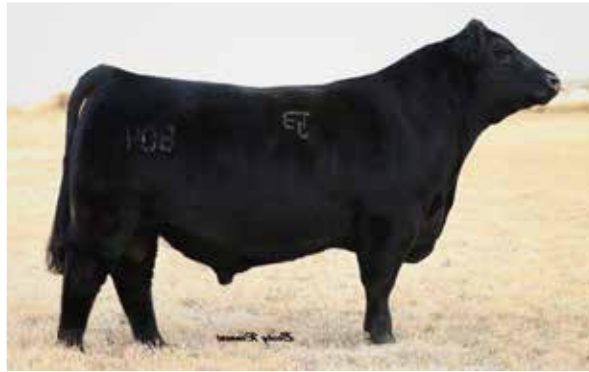
Rebel Yell / 3/4 brother to Lots 23 & 24